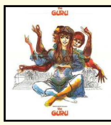
Didi designed sets of Ivory-Merchant Film the Guru - 1969